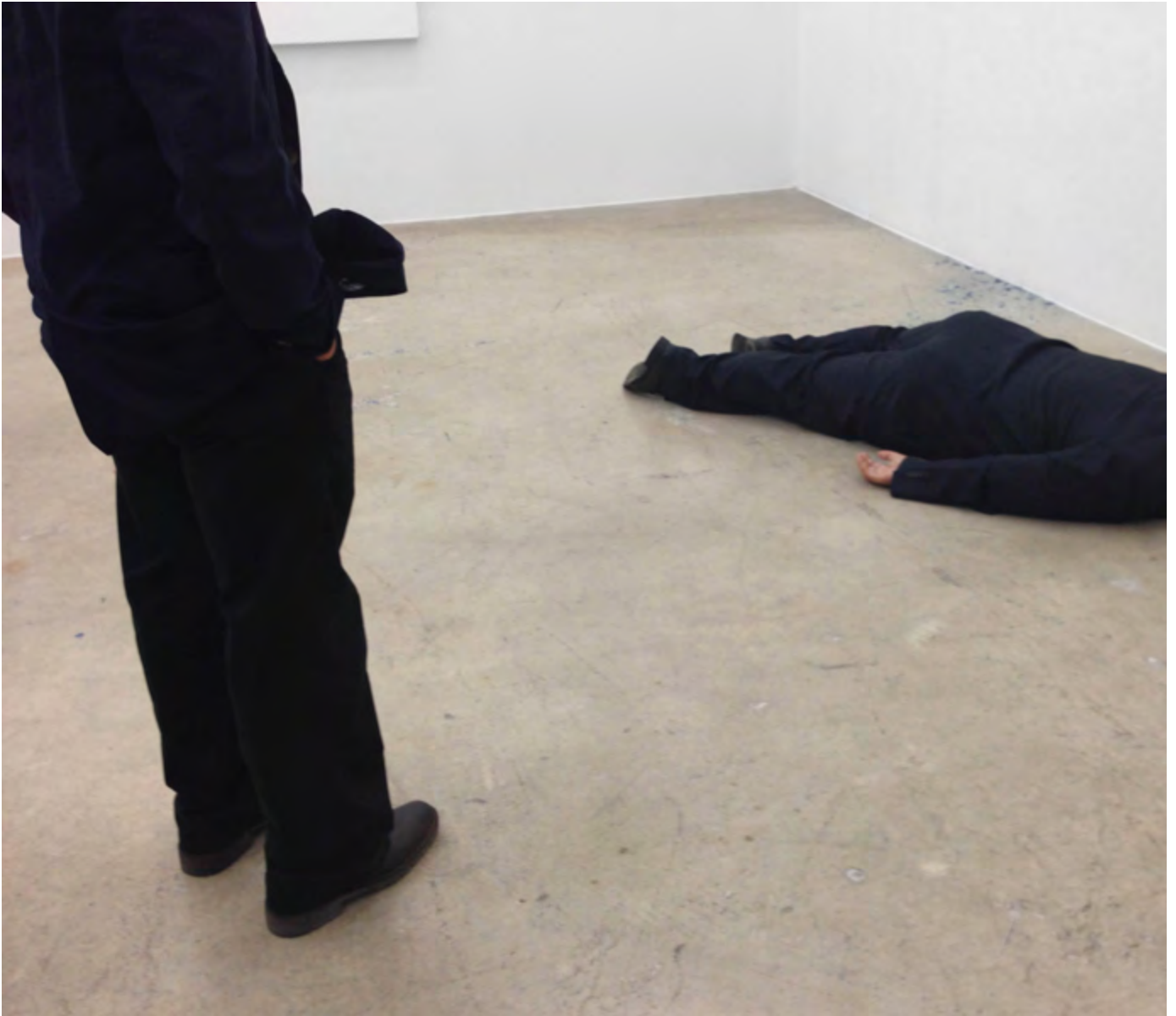
an observer looks at the contorted human figure on the floor image © designboom