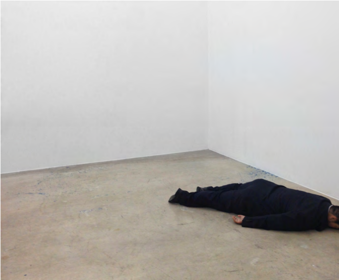
the lifeless positioning reflects the artist's political persecution