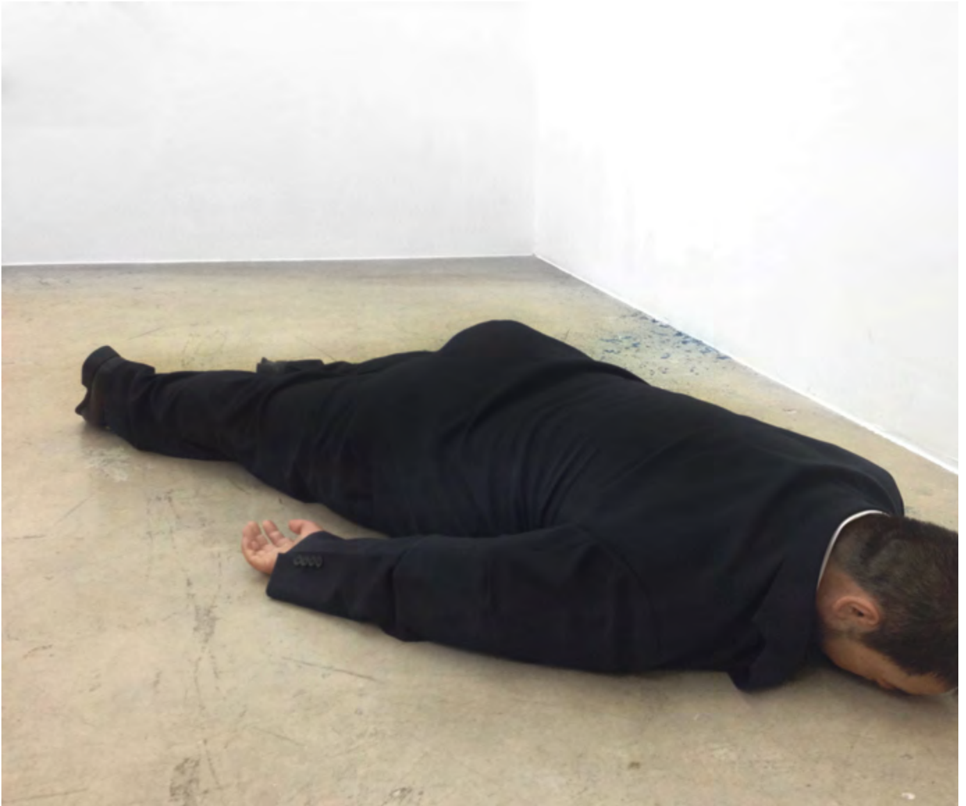
'the death of marat' sits on the gallery floor