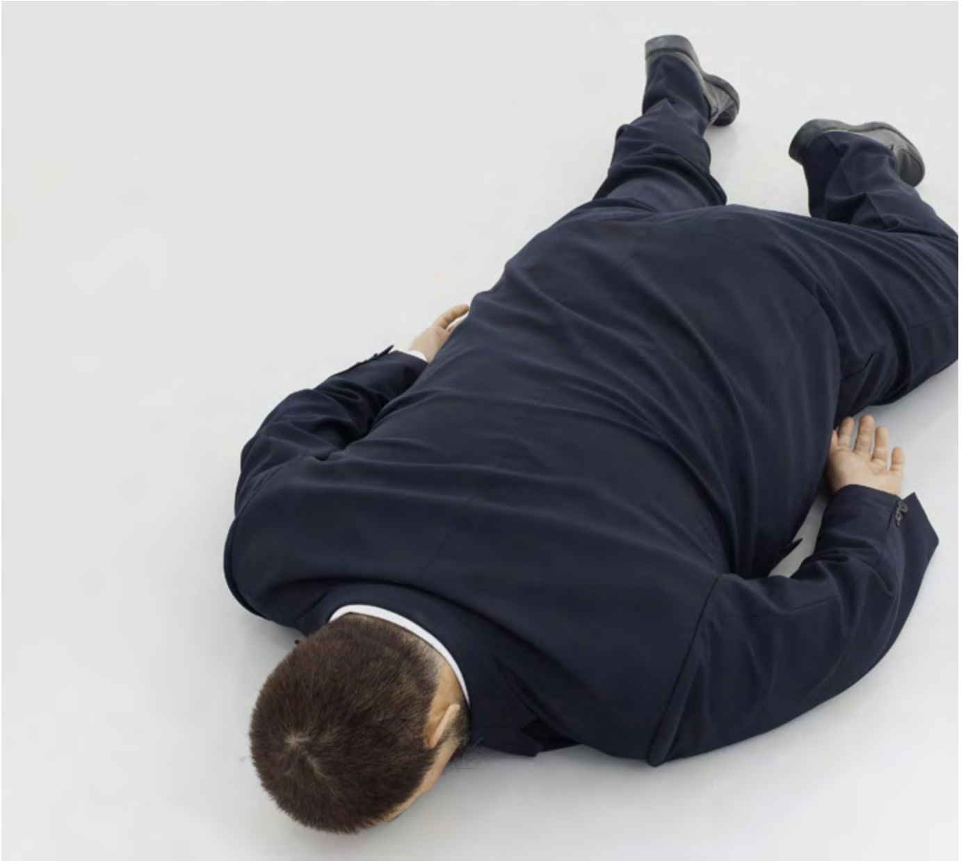
fiberglass ai weiwei lies face down on the ground