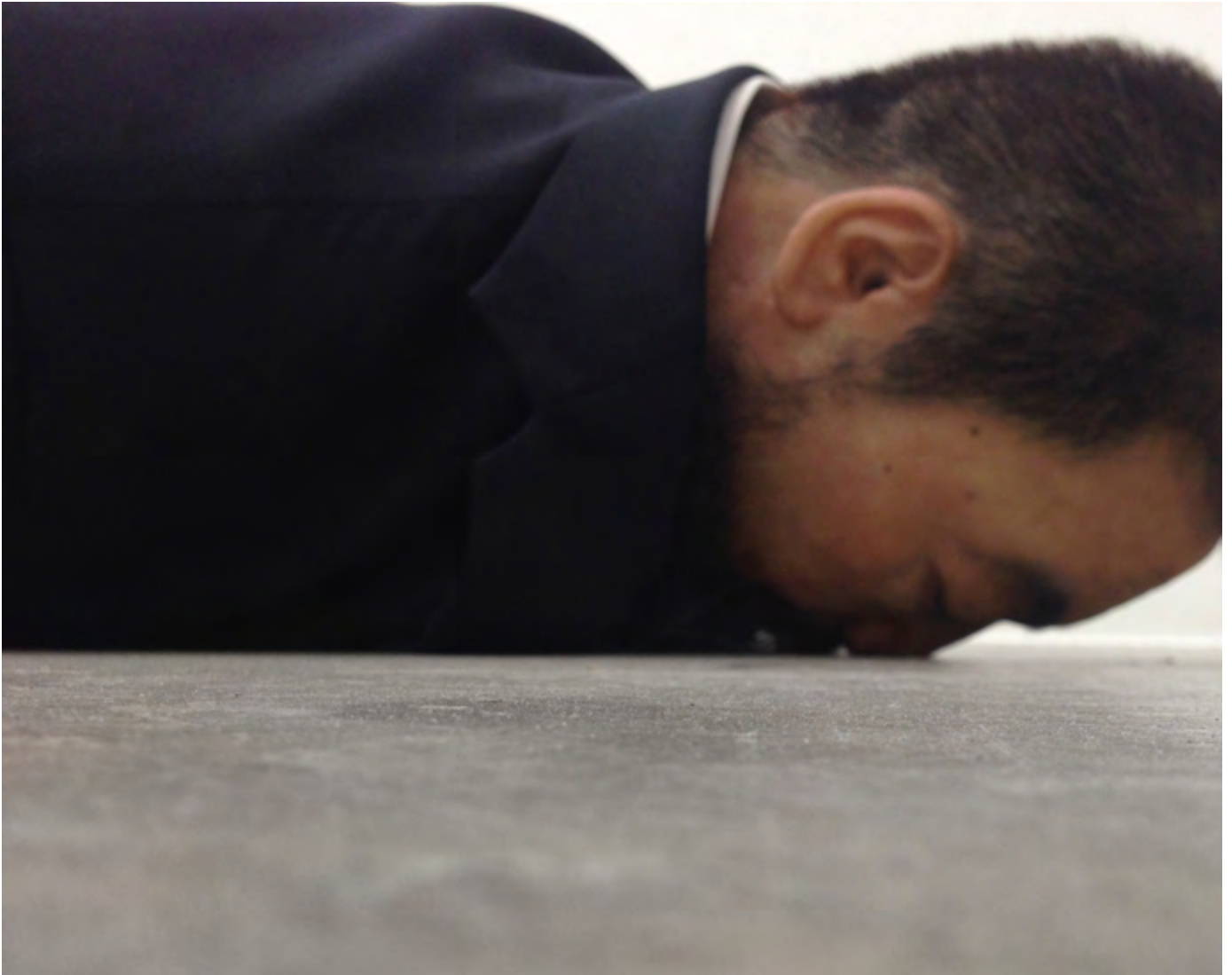
detail of the sculpture's face